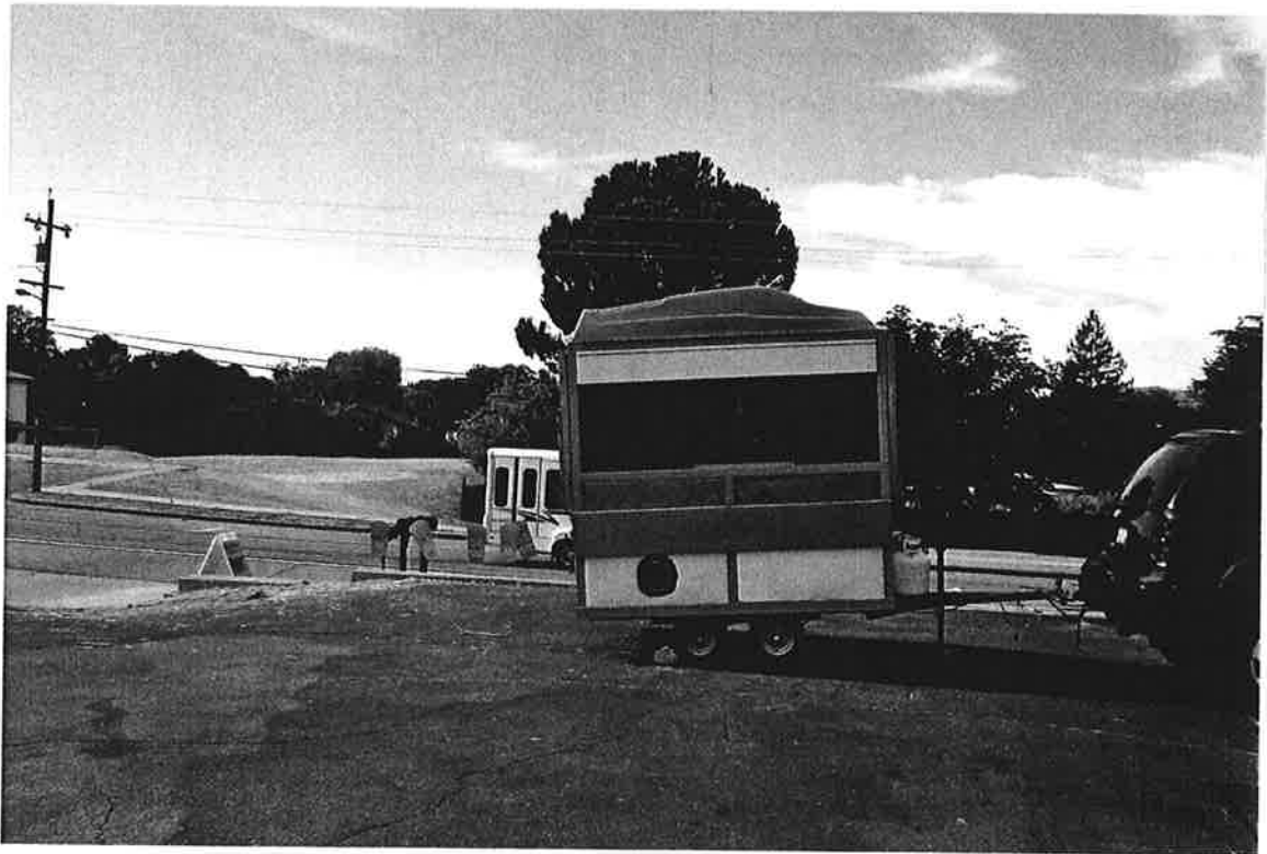
Exhibit B Photos CUP 12-009 (Sandoval)