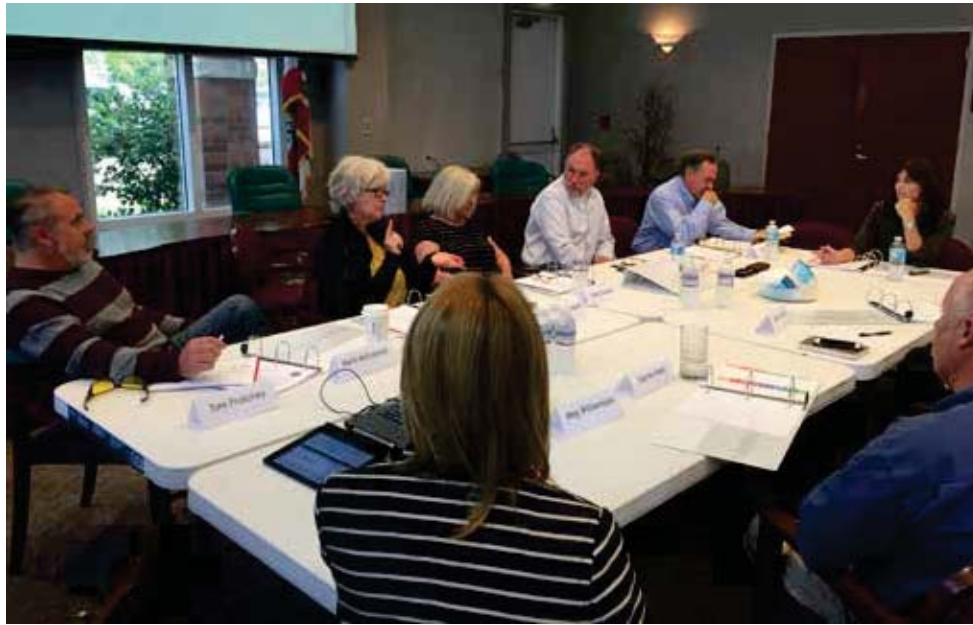
May 4, 2016 Short-Term Rental Task Force kick-off meeting