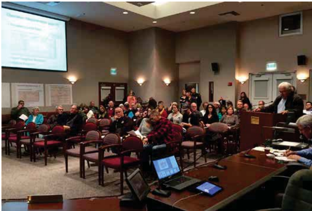
January 31, 2017 Council Workshop