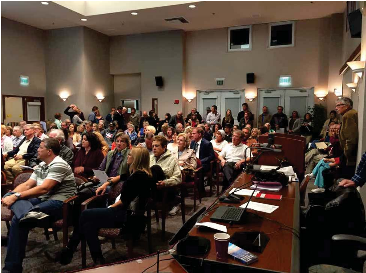
November 4, 2015 Community Workshop

and concerned neighbors. The theme of the meeting comments was balanced between the need to protect residential neighborhoods while promoting tourism and economic development.