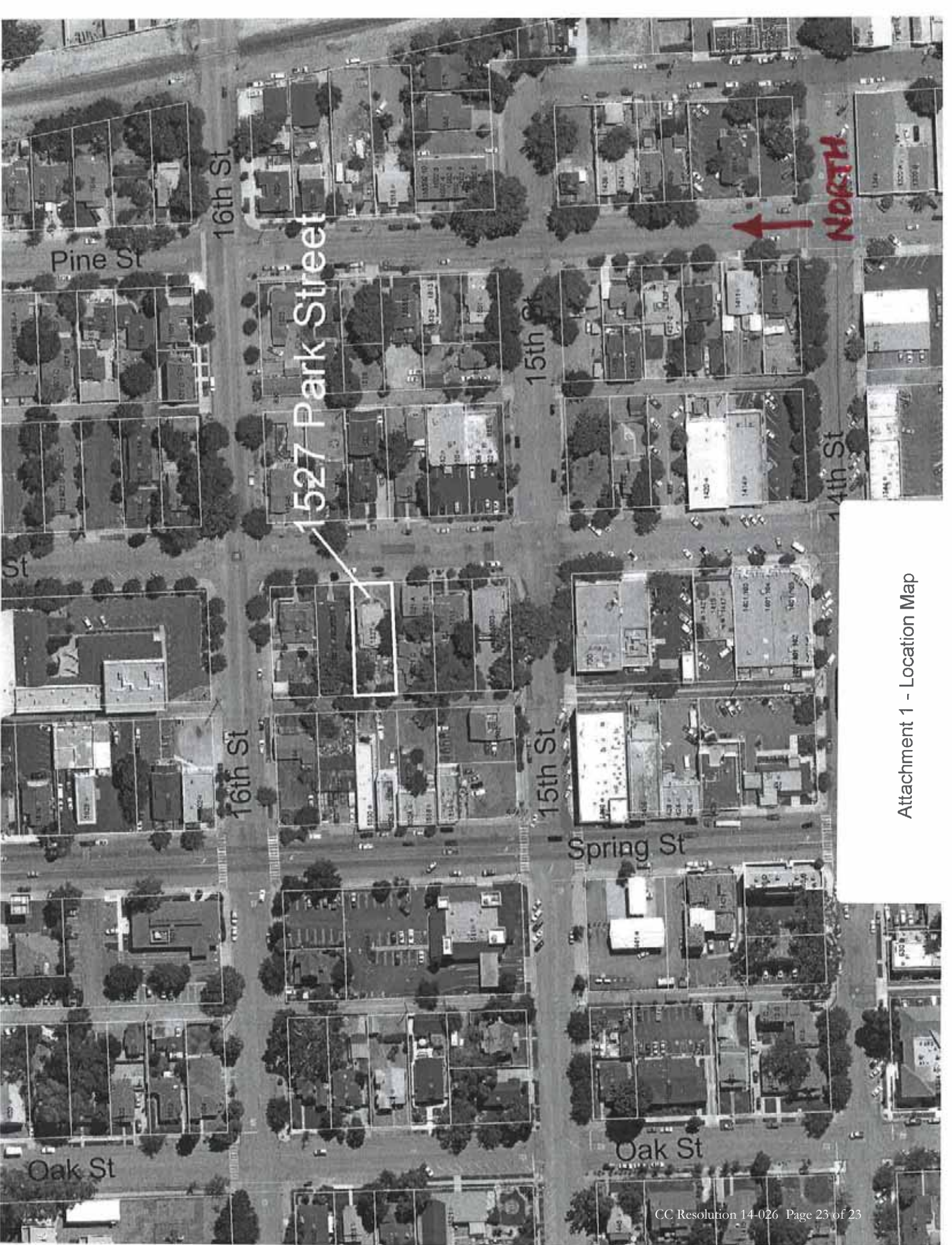
Attachment 1 - Location Map