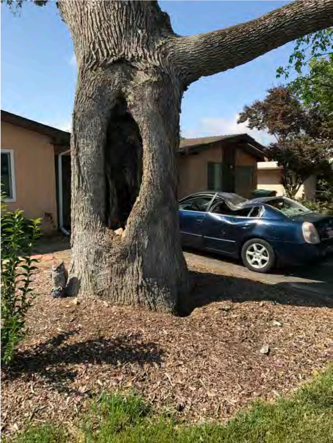
Totaled car in the background