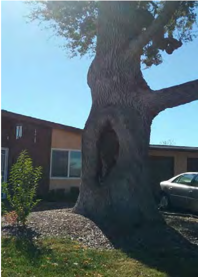
Photos of 40-inch Blue Oak