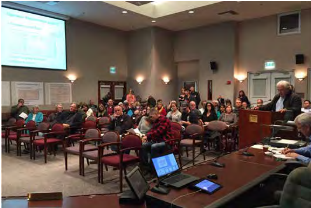
January 31, 2017 Council Workshop