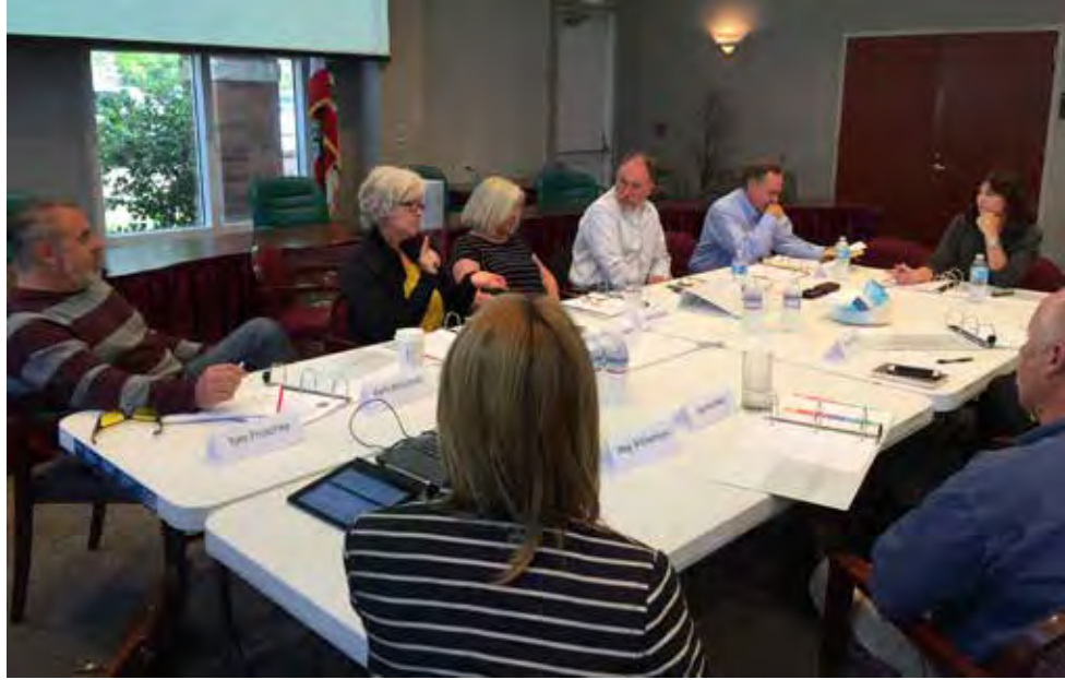
May 4, 2016 Short-Term Rental Task Force kick-off meeting