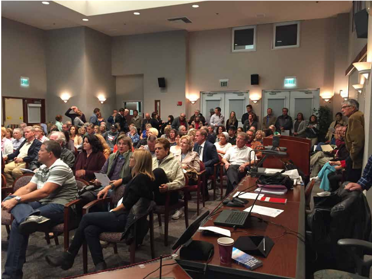
November 4, 2015 Community Workshop