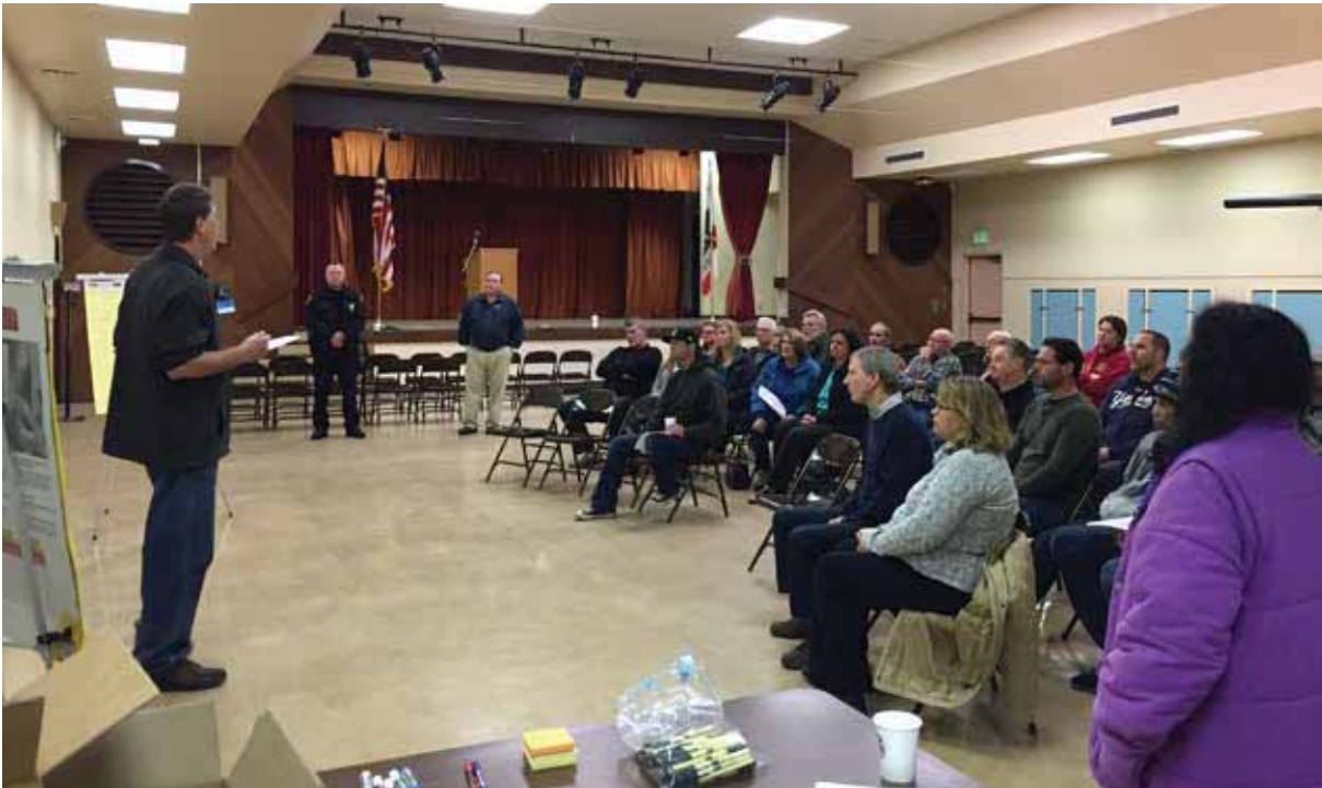
Wednesday night, February 22, 2017 - Shadow Canyon neighborhood public workshop - Daniel Lewis Middle School

Neighbor concerns with speeding, parking, and congestion have increased as the Shadow Canyon neighborhood has built out since 2002, culminating with the petition received by the Council in September of 2016.