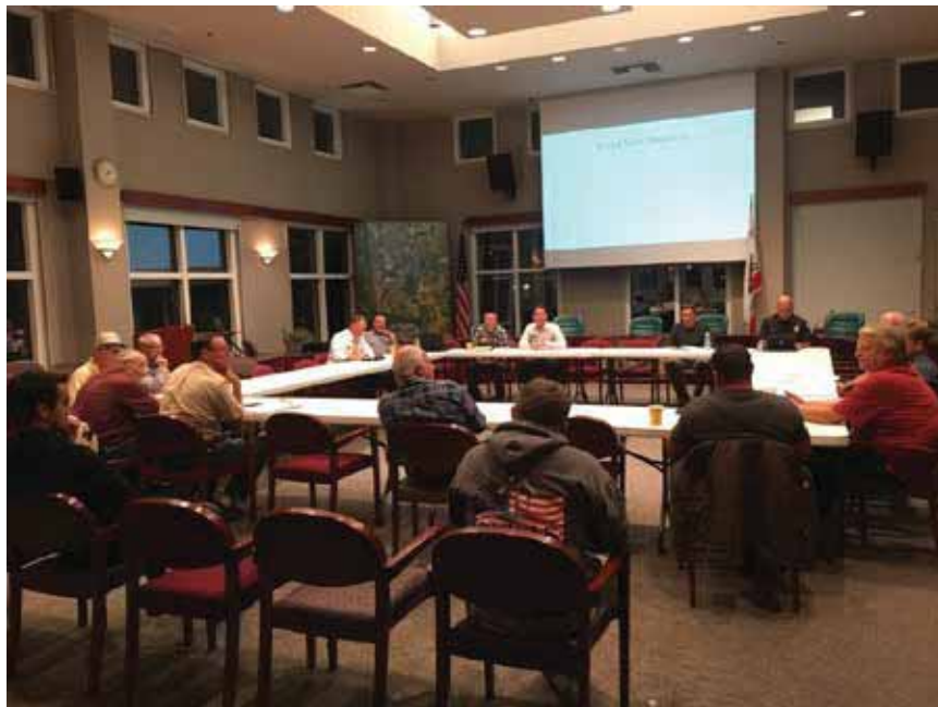
October 17, 2016 Building Code Changes Public Workshop – City Council Chamber