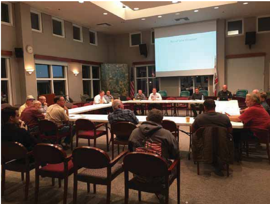
October 17, 2016 Building Code Changes Public Workshop – City Council Chamber