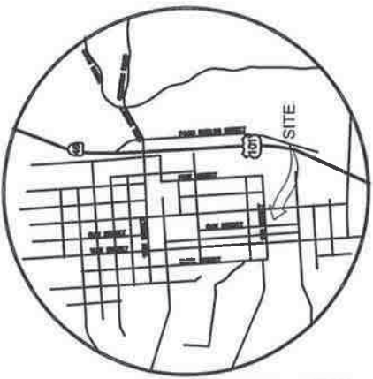
LOCATION MAP NO SCALE