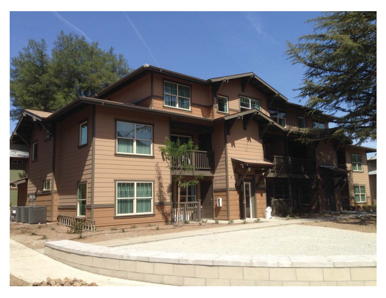
810 – 29th Street (Oak Park)