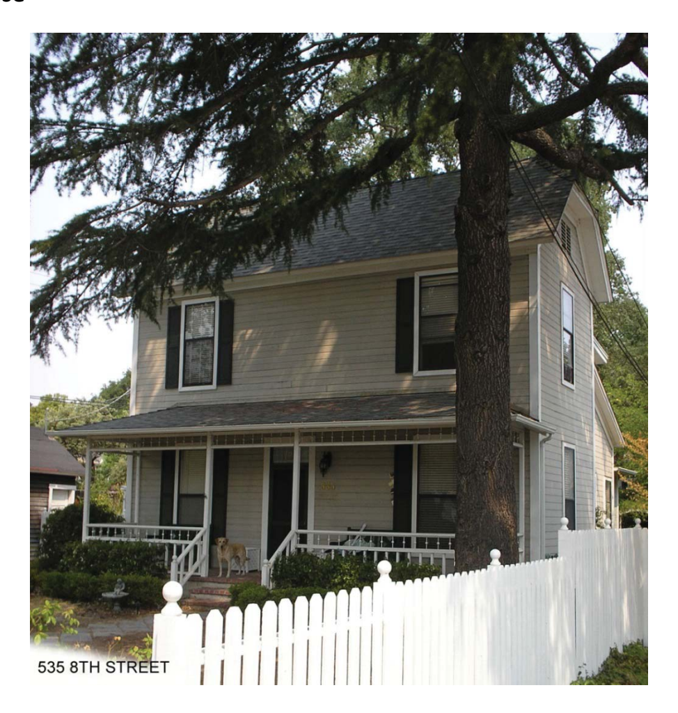
535 – 8<sup>th</sup> Street