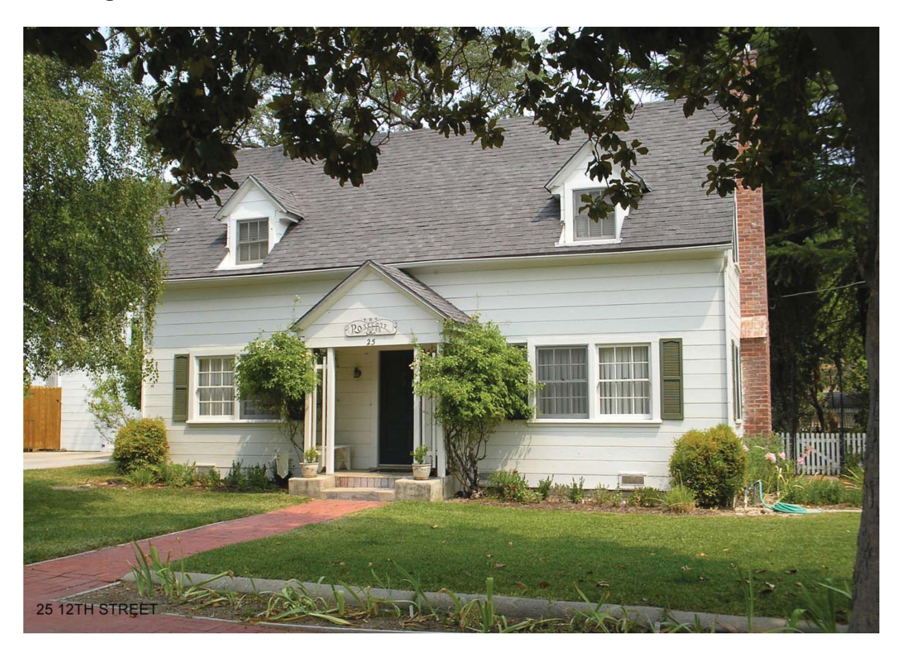
25 – 12<sup>th</sup> Street