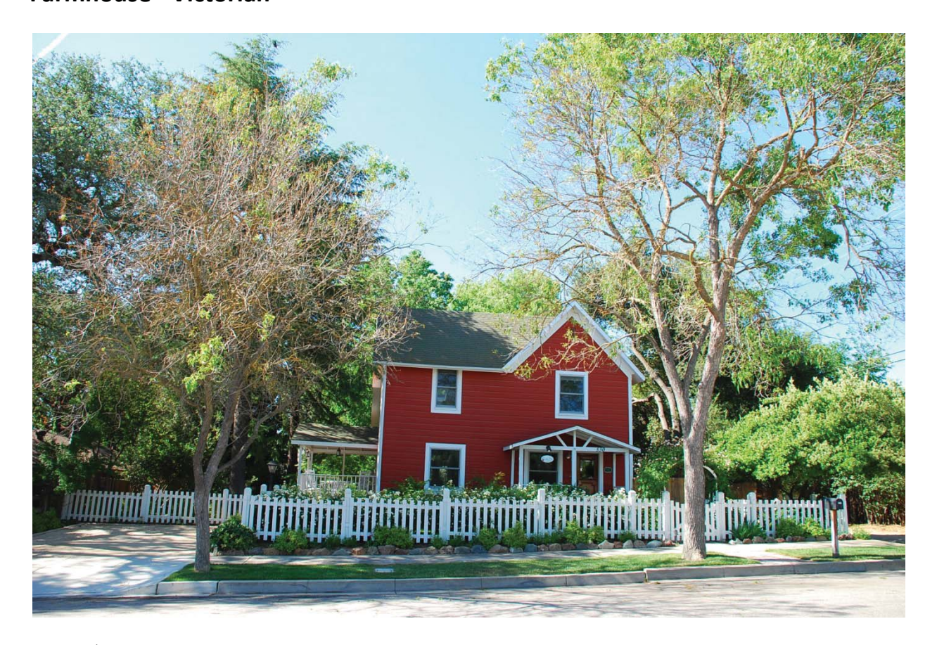
530 – 9<sup>th</sup> Street