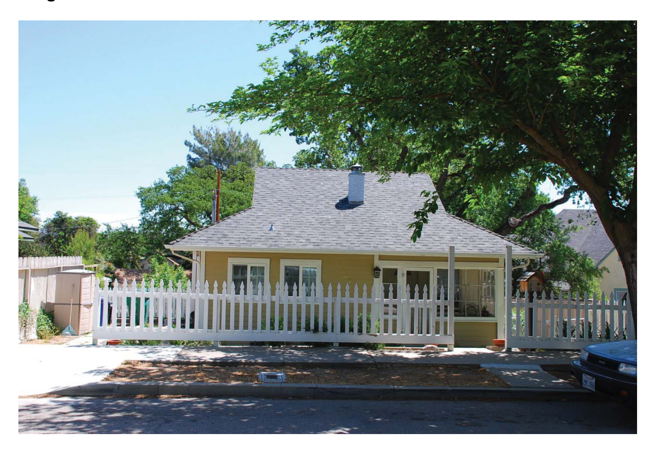
1520 Olive Street