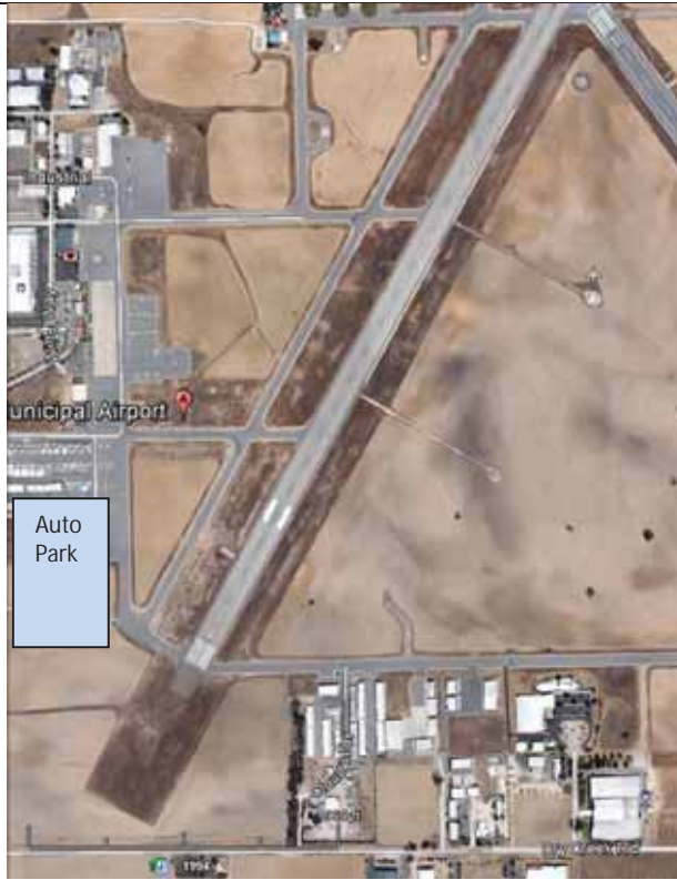
Satellite View of Parking Area