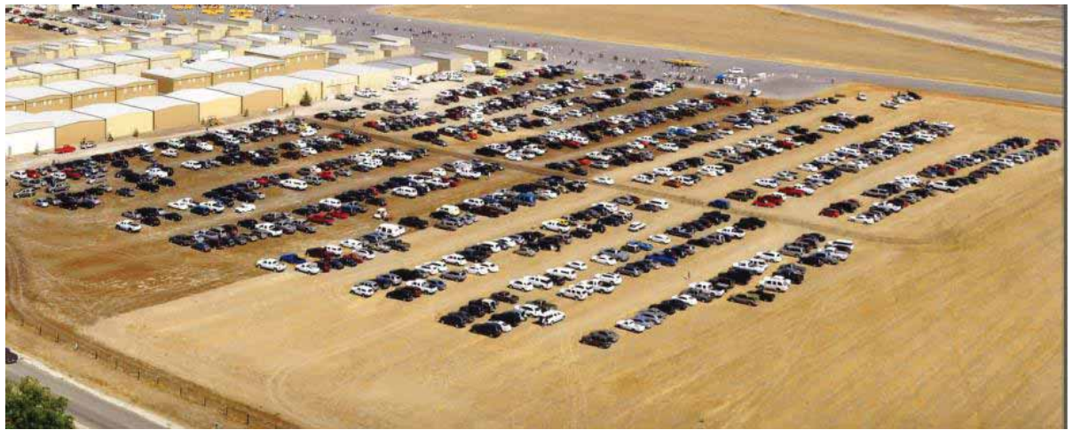
Aerial View of Parking Area on Airport

On-field FBO/fuel provider with desire and ability to participate in the event, with the capacity to provide 100LL fuel service to no less than 250 aircraft within 6 hours, and to expand manpower