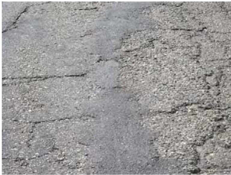
Existing paving condition of Airport Road, from Scott to Linne