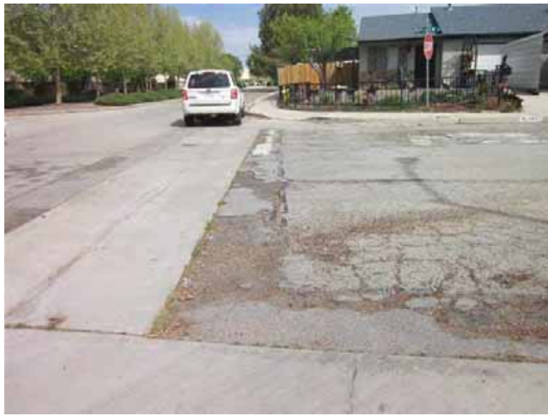
Existing paving condition of Airport Road, from Scott to Linne