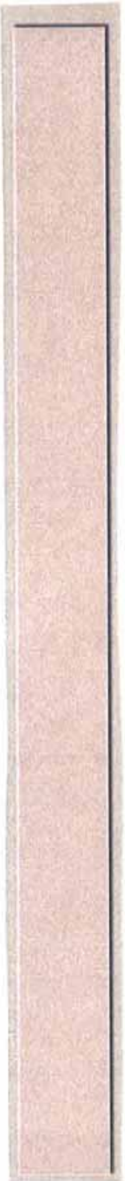
STAIN SINGLE COLOR WITH ANTI-GRAFFITI COATING