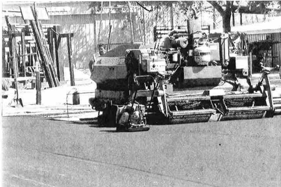
April 3, 2009