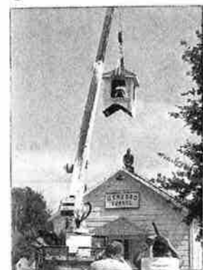
Swinging the belfry with its original bell back to the roof of the schoolhouse; June 9, 2009