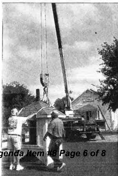
Agenda Item #8 Page 6 of 8