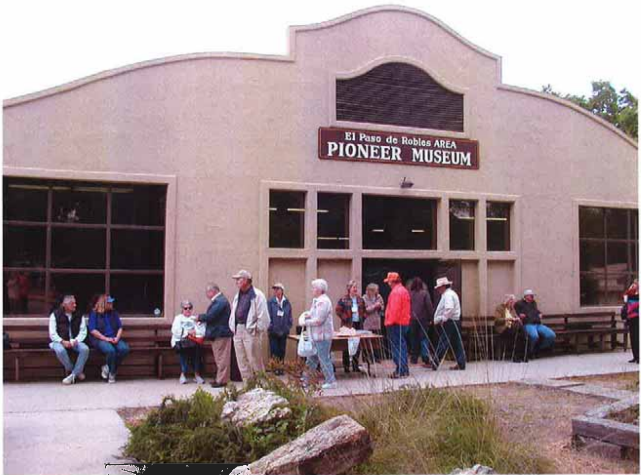
Gathering for the Paso Robles Chamber of Commerce's Agri-Business Tour, May 2006

2010 Riverside Avenue • P.O. Box 461 • Paso Robles, CA 93447