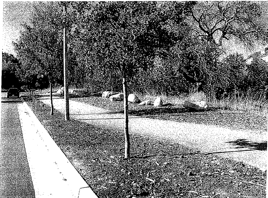
The proposed river trail will connect to the existing walkways in Larry Moore Park

The Project in Paso Robles will begin just north of Niblick Bridge and extend south to Lawrence (Larry) Moore Park. Access to the trails will be from the Wal-Mart shopping complex, Larry Moore Park, Niblick Road Bridge and the new development north of Albertson's on the east side of the river at Niblick Bridge. The southern portion of Reach A will incorporate 1.5 miles of trail and boardwalk through riparian areas along the east side of the river. Design and installation of an unobtrusive barrier fence placed in strategic areas will help to block popular illegal access points for off-road vehicles to the river channel. Vehicles have caused damage to riparian vegetation within the channel.